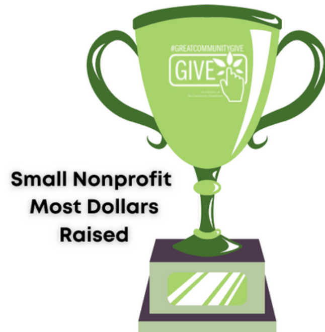
Small Nonprofit Most Dollars Raised