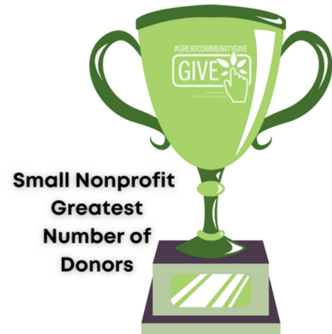
Small Nonprofit Greatest Number of Donors