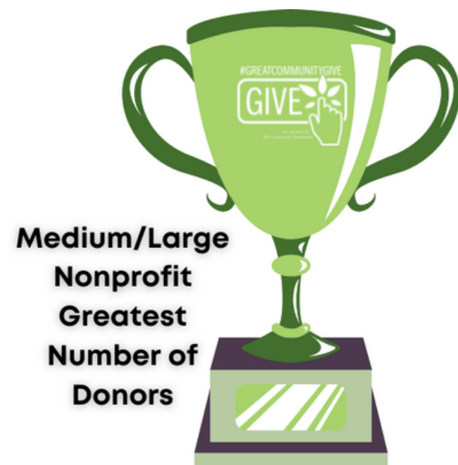
Medium/Large Nonprofit Greatest Number of Donors