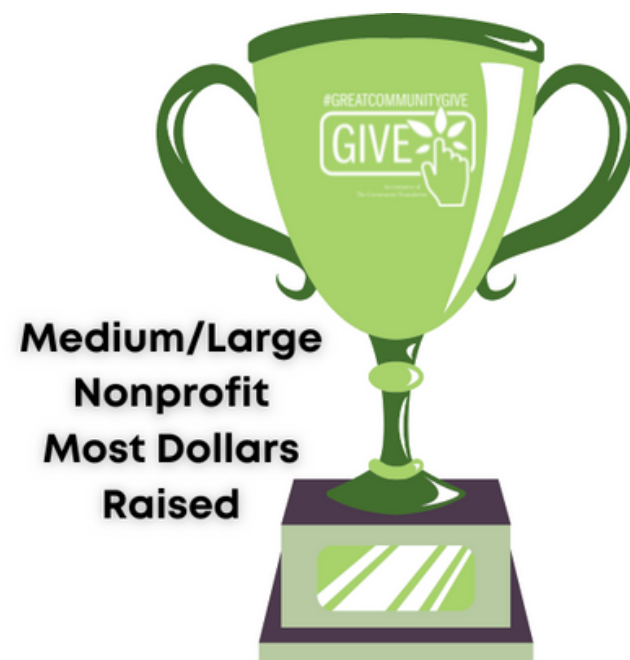
Medium/Large Nonprofit Most Dollars Raised