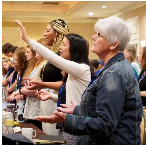
One Example of a Facebook Cover Image